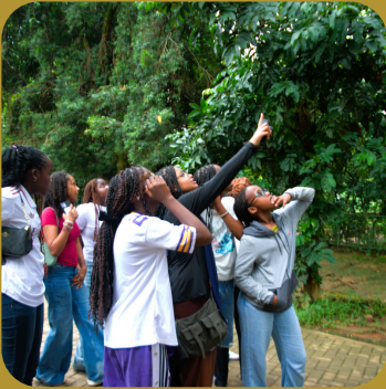
Acorns Exchange Programme pg. 4