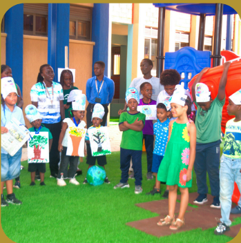
Earth Day pg. 6