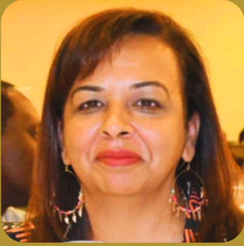
Updates from the CEO pg. 1